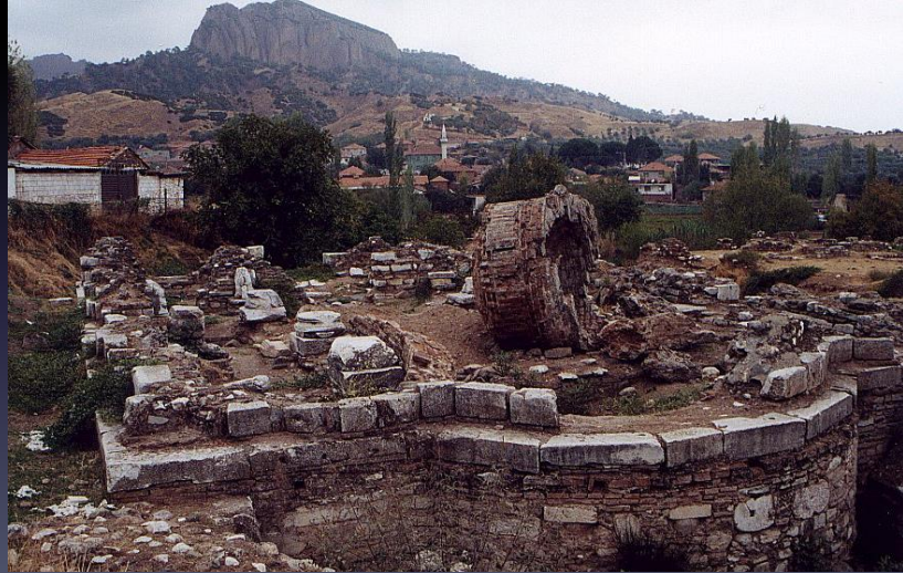
Church ruins in Sardis