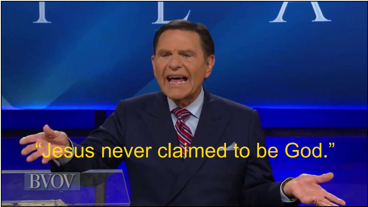
“Jesus never claimed to be God.”