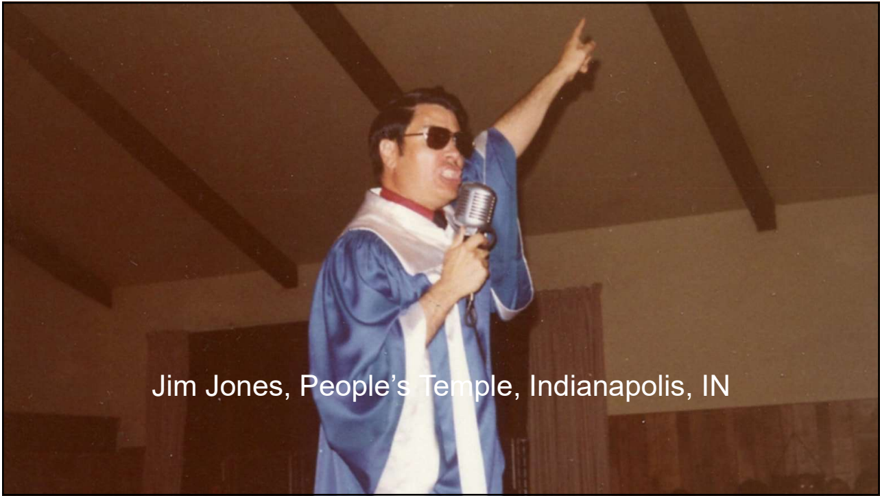
Jim Jones, People's Temple, Indianapolis, IN