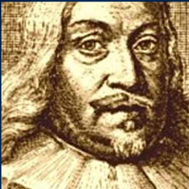
Friedrich Von Logau 1605 – 1655